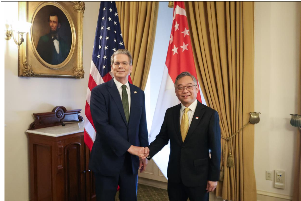
DPM and Minister for Trade and Industry Gan Kim Yong meets United States Secretary of the Treasury Scott Bessent