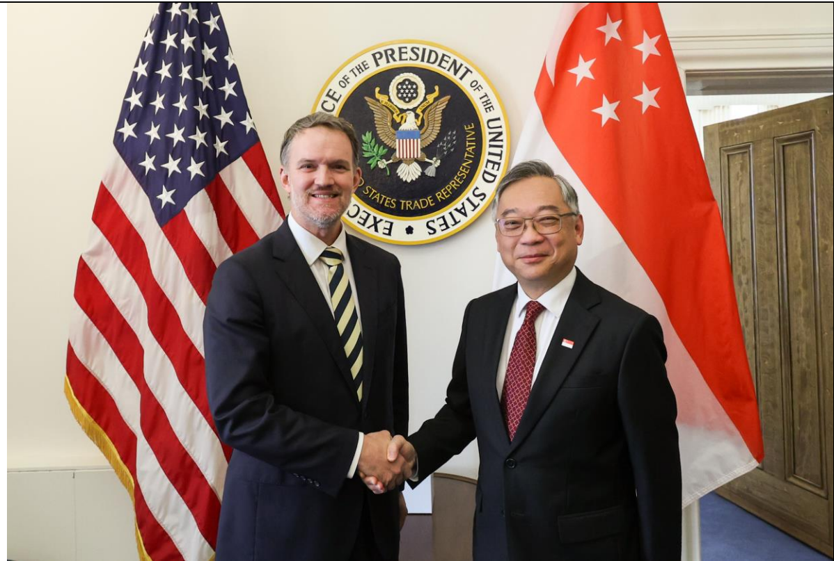
DPM and Minister for Trade and Industry Gan Kim Yong meets US Trade Representative Ambassador Jamieson Greer