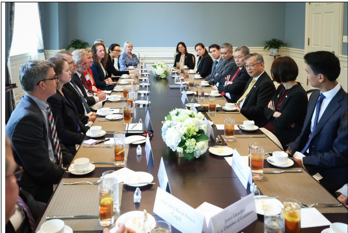
DPM and Minister for Trade and Industry Gan Kim Yong has a roundtable discussion with the US Chamber of Commerce and business representatives