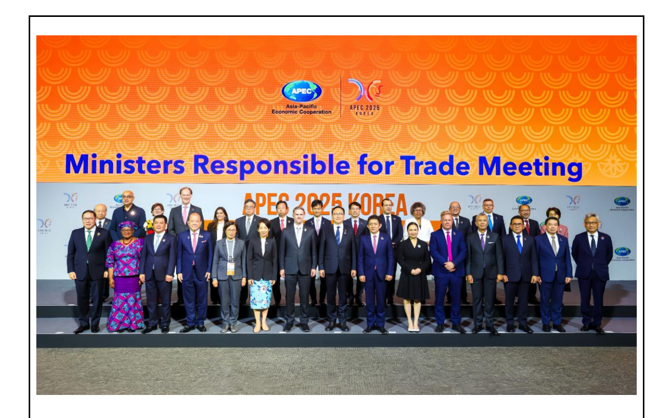
Photo Caption: Minister-in-charge of Trade Relations Grace Fu at the 2025 APEC Ministers Responsible for Trade (MRT) Meeting in Jeju, Republic of Korea.