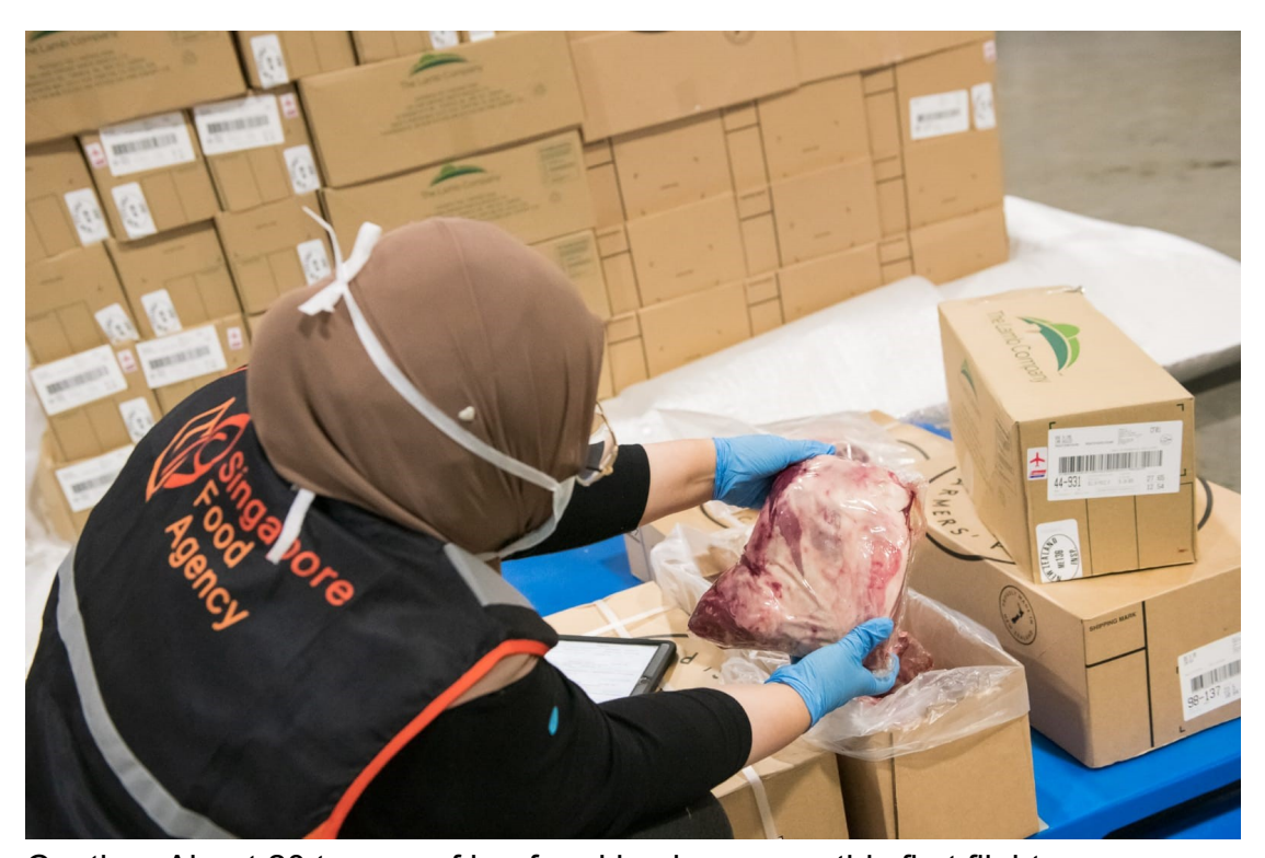
Caption: About 20 tonnes of beef and lamb were on this first flight.