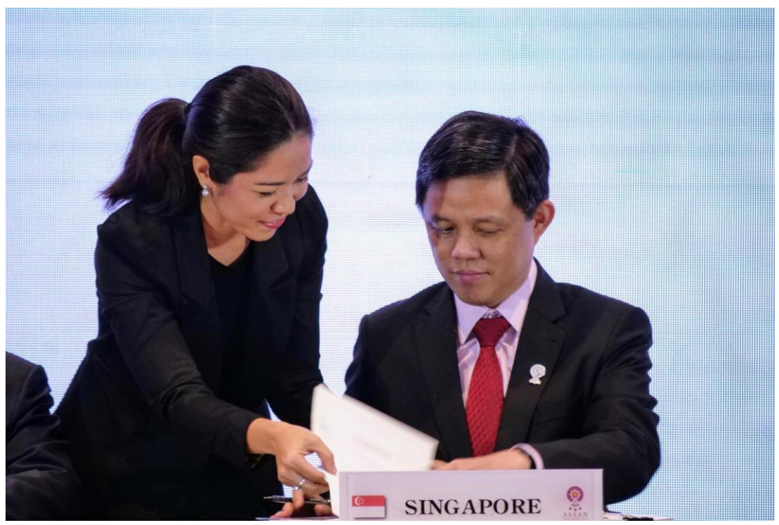
Caption: Minister Chan Chun Sing signing the ASEAN Protocol on Enhanced Dispute Settlement Mechanism.