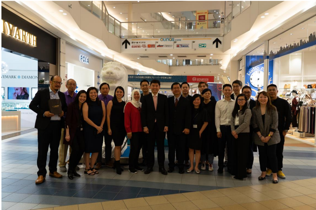
Caption: Senior Minister of State for Trade and Industry & Education, Mr Chee Hong Tat, and representatives from Singapore food companies as well as the Singapore Food Manufacturer's Association (SFMA), at the launch of the Taste of Singapore food pop-up event led by Enterprise Singapore, held on 11 October 2019 in Olinas Mall, Tokyo, Japan.