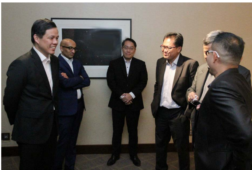
Caption: Minister for Trade and Industry Chan Chun Sing meets with economists from Indonesia on 17 September 2019.