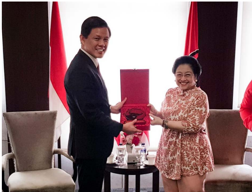
Caption: Minister for Trade and Industry Chan Chun Sing calls on former President of Indonesia and PDI-P Chairperson Megawati Sukarnoputri on 18 September 2019.