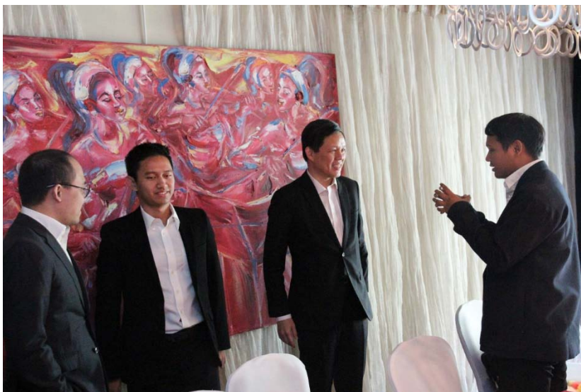
Caption: Minister for Trade and Industry Chan Chun Sing meets with Indonesian digital economy players on 17 September 2019.