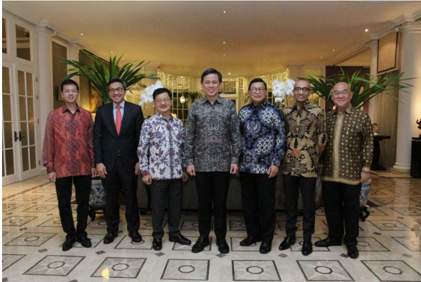
Caption: Minister for Trade and Industry Chan Chun Sing meets with senior businessmen from Indonesia on 16 September 2019.