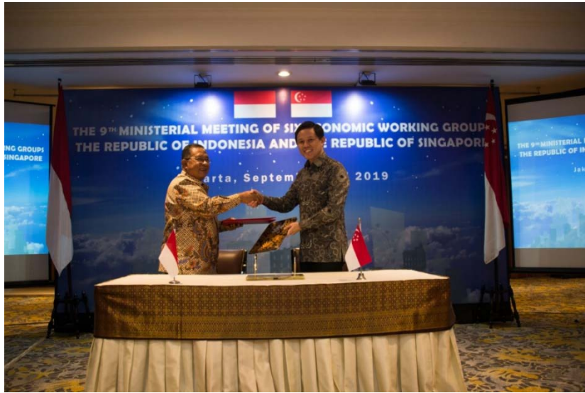
Caption: Minister for Trade and Industry Chan Chun Sing and Indonesia's Coordinating Minister for Economic Affairs Darmin Nasution at the 9 th Singapore-Indonesia Six Bilateral Economic Working Groups (6WG) Ministerial Meeting on 16 September 2019 in Jakarta, Indonesia