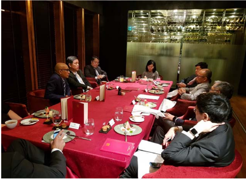
Caption: Minister for Trade and Industry Chan Chun Sing meets with Economist and Former Indonesia Finance Minister Muhammad Chatib Basri (pictured on the right, in grey blazer) on 17 September 2019.