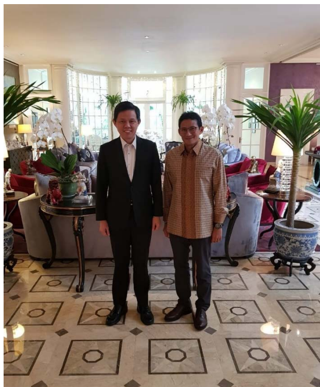
Caption: Minister for Trade and Industry Chan Chun Sing meets with Former Jakarta Vice-Governor Sandiaga Uno on 18 September 2019.