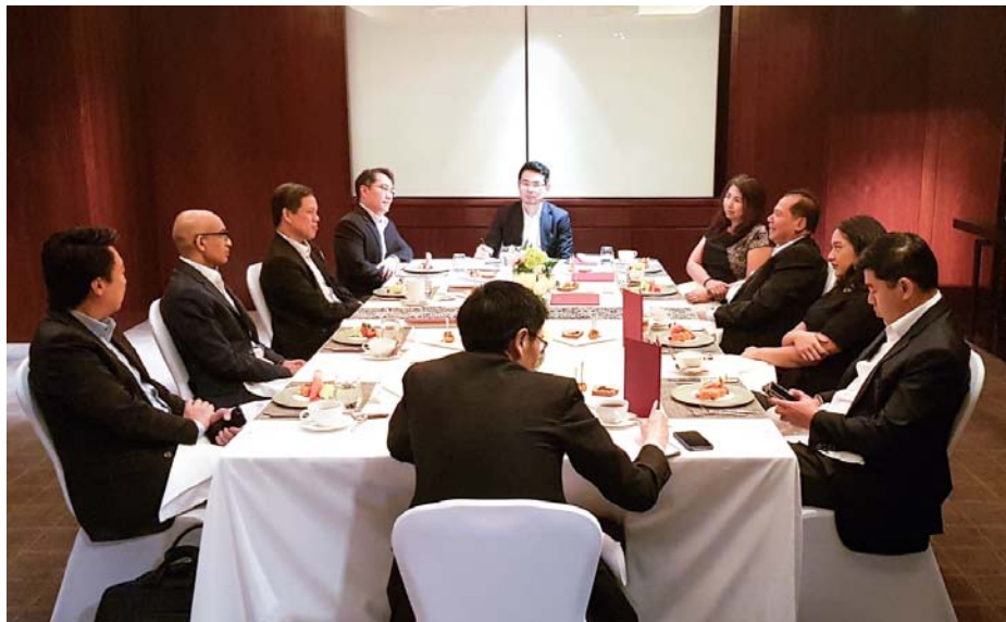
Caption: Minister for Trade and Industry Chan Chun Sing meets with Founder and Chairman of CT Corp Chairul Tanjung on 18 September 2019.