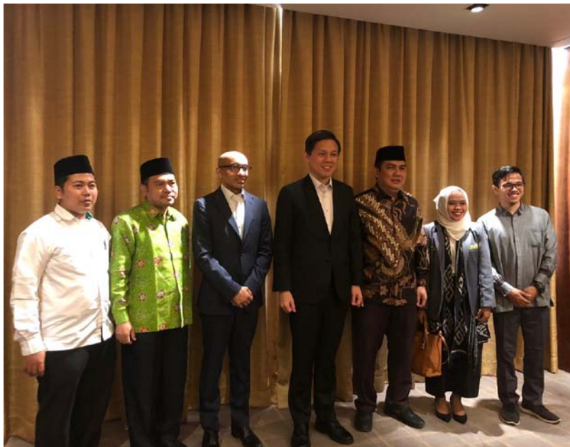
Caption: Minister for Trade and Industry Chan Chun Sing meets with Secretary General of Nahdlatul Ulama (NU) Helmy Faishal Zainal and NU young leaders on 18 September 2019.