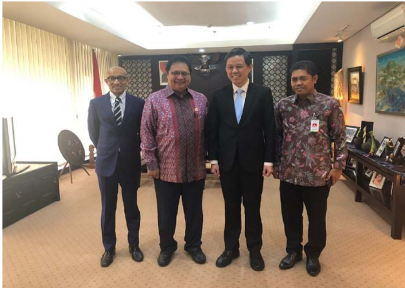
Caption: Minister for Trade and Industry Chan Chun Sing calls on Indonesia's Industry Minister Airlangga Hartarto on 17 September 2019.