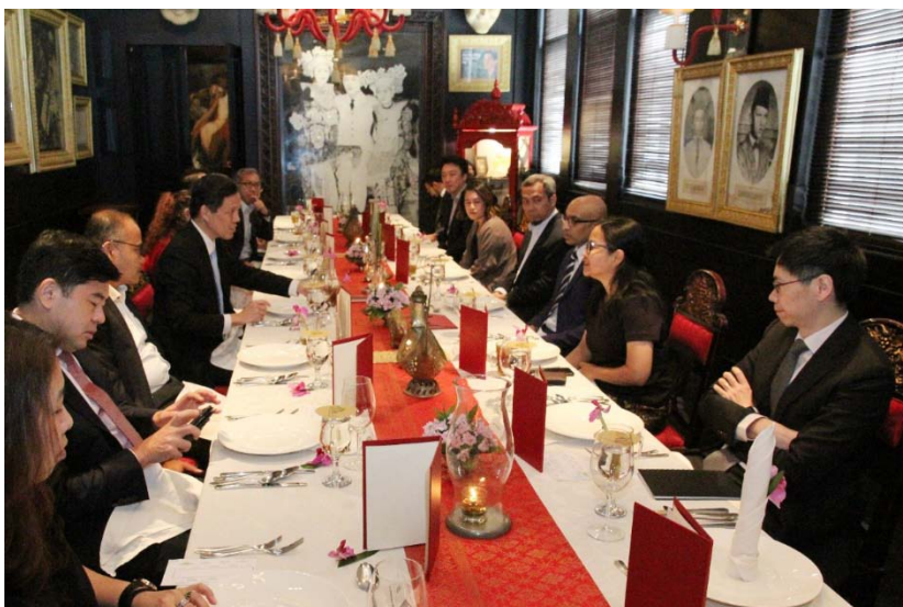
Caption: Minister for Trade and Industry Chan Chun Sing has lunch with Indonesian media on 17 September 2019.