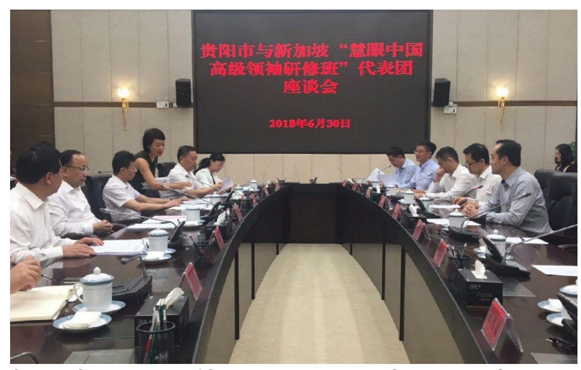
Caption: Senior Minister of State Koh Poh Koon and Guiyang Party Secretary Zhao Deming at the Roundtable Discussion.