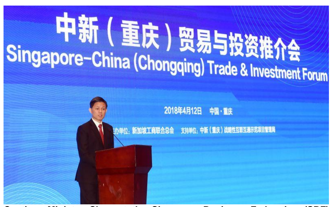
Caption: Minister Chan at the Singapore Business Federation (SBF) Singapore-China (Chongqing) Trade & Investment Forum

Caption: Minister in the Prime Minister's Office Chan Chun Sing at the opening of the Singapore Chamber of Commerce and Industry in China (SingCham)'s Chongqing chapter.