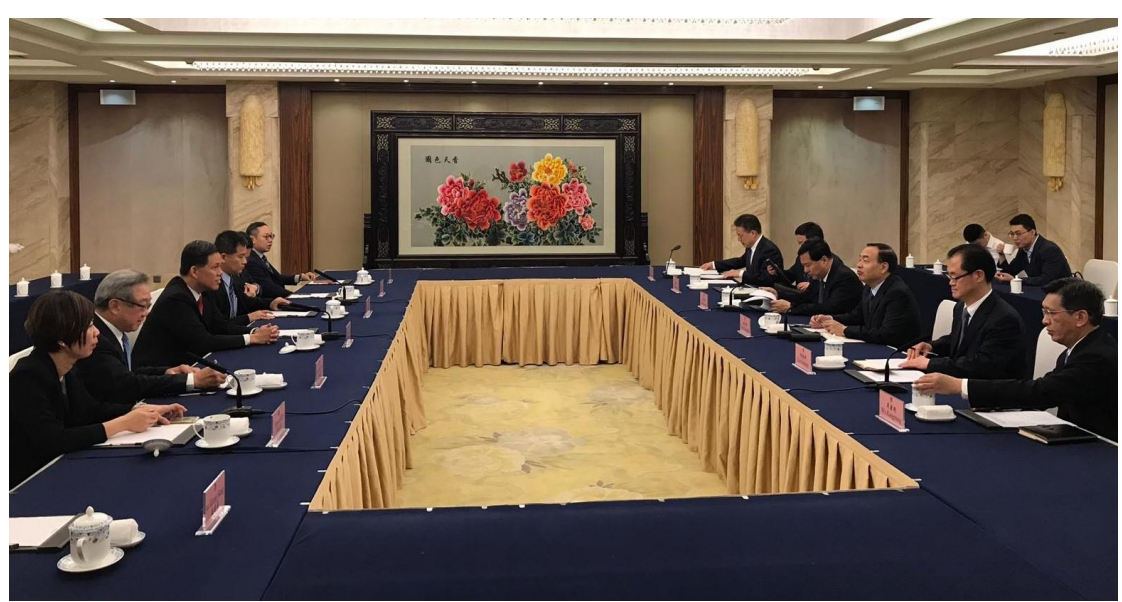
Caption: Minister in the Prime Minister's Office Chan Chun Sing meeting with Chongqing Mayor Tang Liangzhi.