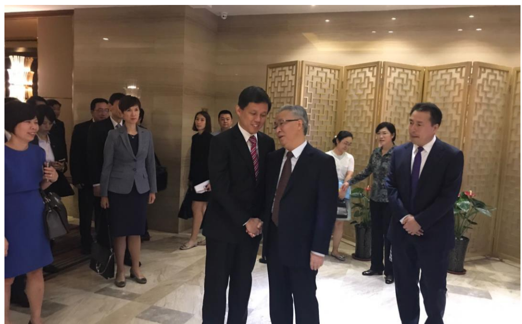
Minister Chan Chun Sing met Chongqing Mayor Zhang Guoqing and cochaired the third Joint Implementation Committee (JIC) Meeting for the China-Singapore (Chongqing) Connectivity Initiative in Chongqing today.