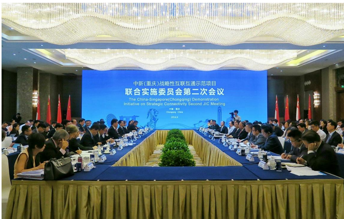
Caption: Singapore and Chongqing delegates at the second Joint Implementation Committee (JIC) Meeting for the Chongqing Connectivity Initiative in Chongqing today.