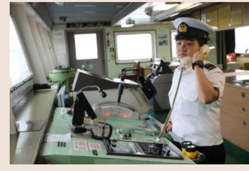
Execution of voyage navigation, cargo handling, and ship operations