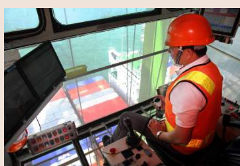
Manual operation of single crane at any one time