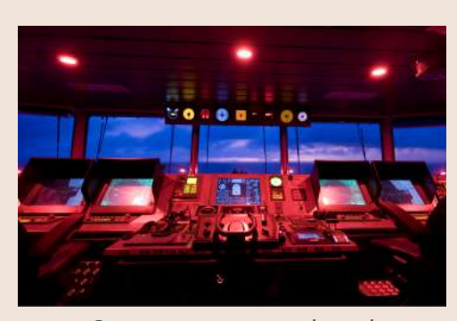
Operate smart vessels and interface with future port