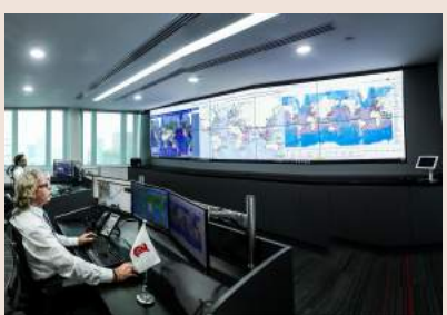
Remote monitoring and diagnostics of global fleet for efficient and safe operations