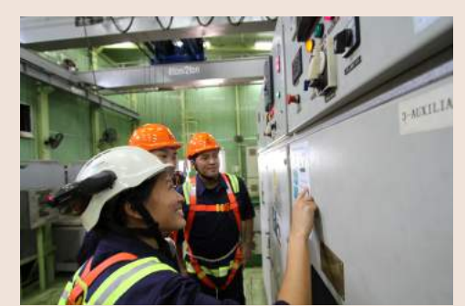
Specialised engineers maintaining machinery and systems