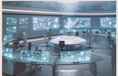
Smart sensors that feed Big Data to shore for predictive maintenance of vessels