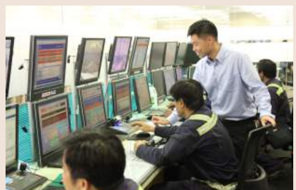
Sensors and analytics for enhanced sense-making and predictive maintenance