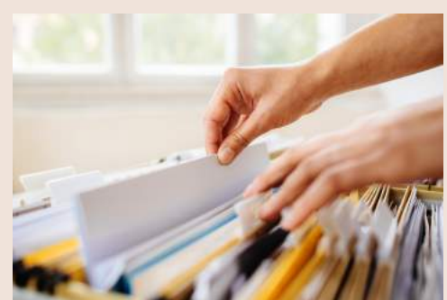
Handling of fragmented information systems with manual and tedious paperwork